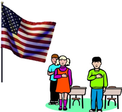
Pledge of Allegiance

Circle the picture of an example of a Patriotic tradition