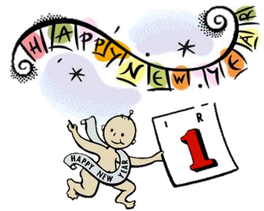
Celebrating the New Year

Circle the picture of an example of a Patriotic tradition